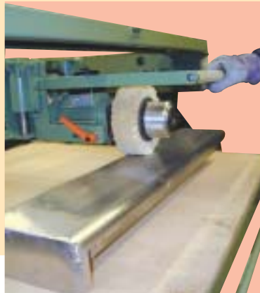
Polish fabricated parts

Ideal for finishing sheet, plate, extrusions, fabrications, tubes, hollow section, bar, etc.