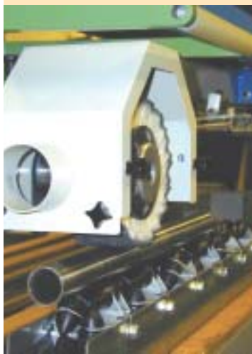
Longitudinal polishing of tubular parts