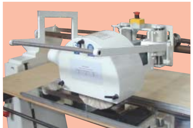
Polish flat parts

For satin finishing and mirror polishing of flat, curved and tubular parts