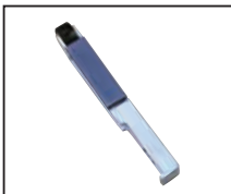
Part No. 6U-610341 Contact Arm 13mm