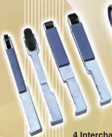
4 Interchangeable Contact Arms