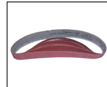
Part No. 6U-6103060 (3 pcs) 13mm x 12", #60 grit