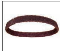
Part No. 6U-6103PB15 Surface Prep Belt (coarse) 13mm x 12", #150 grit