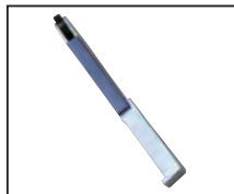
Part No. 6X-610341 Contact Arm 6mm