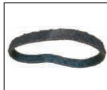
Part No. 6U-6103PB30 Surface Prep Belt (fine) 13mm x 12", #300 grit