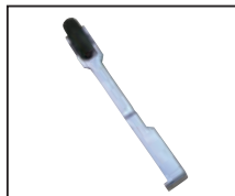
Part No. 6V-610341 Contact Arm 13mm