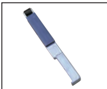
Part No. 6Y-610341 Contact Arm 13mm